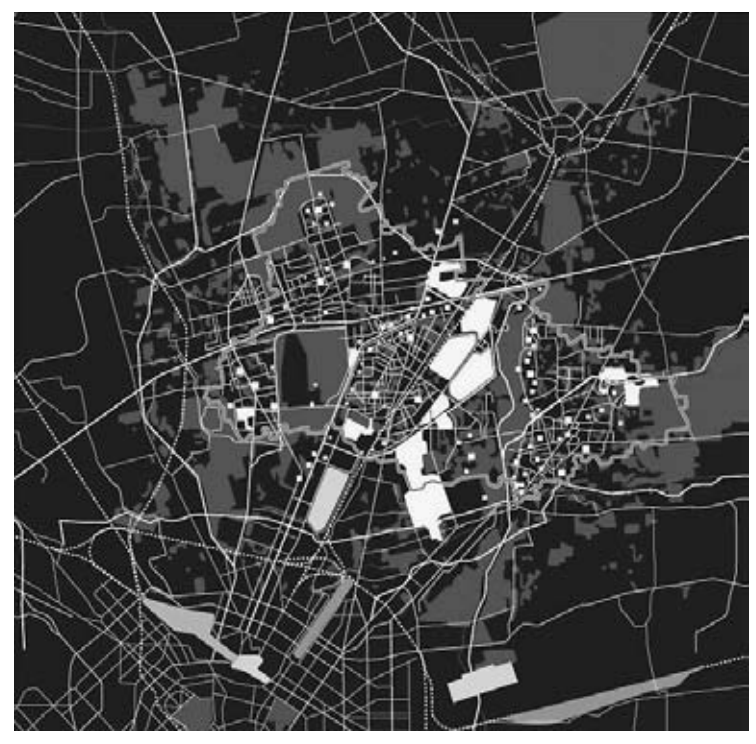
Fig. 3: Strategic Plan Milano Nord.

In this perspective the great part of the problems to be addressed have not municipal boundaries – local economic development, the restoration of the environment, the co-ordination of projects regarding infrastructures – but can be treated in an effective way at least at the level of the North Milan area. There is a need for co-ordination that cannot be treated through the institutional system, nor, as it was in the past, through the political parties and their hierarchies, not only because they are in a deep crisis, but also because they still follow the centre-periphery model that the new di-